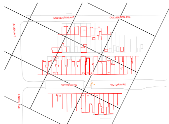
1 Proposed Ground Floor 1 : 1250