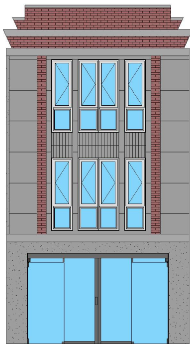
2 Existing Front Elevation 1 : 50