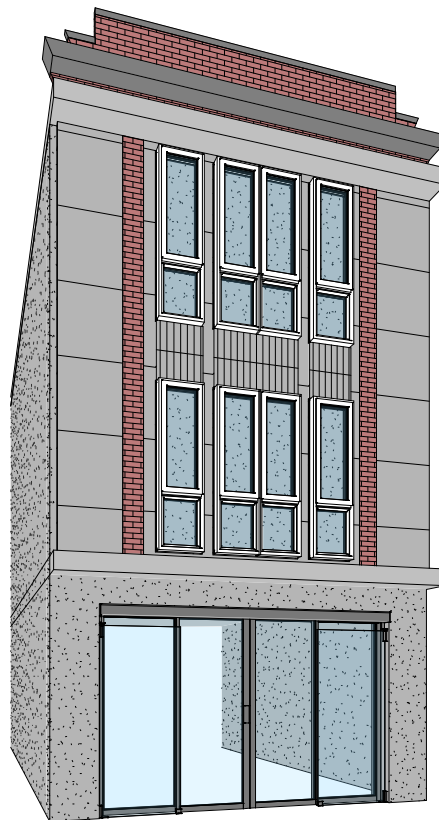
3 3D contextual model-External