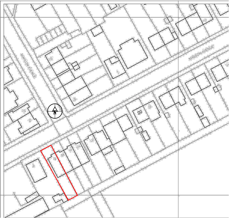
01 - OS MAP SCALE 1:1250