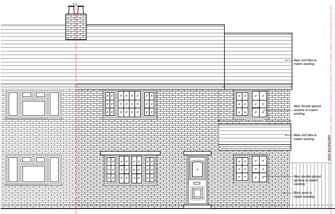
01 - FRONT ELEVATION