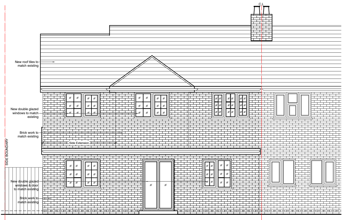
02 - REAR ELEVATION