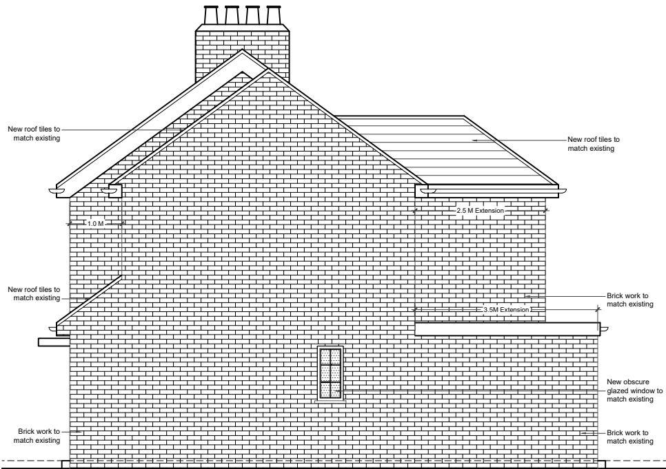
03 - RIGHT SIDE ELEVATION