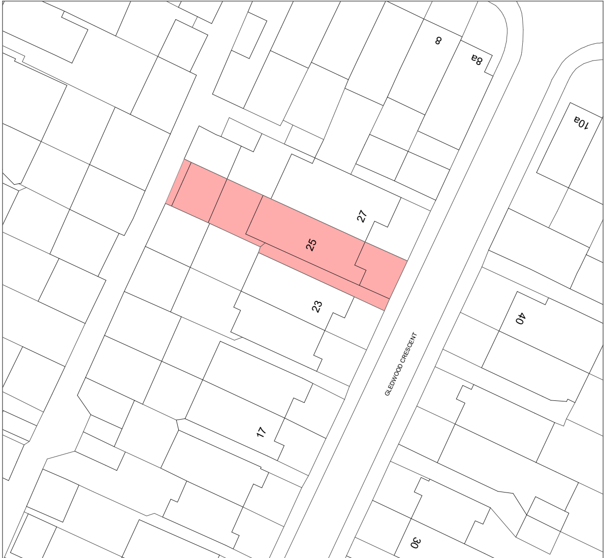
Site Boundary 25 Gledwood Cres.