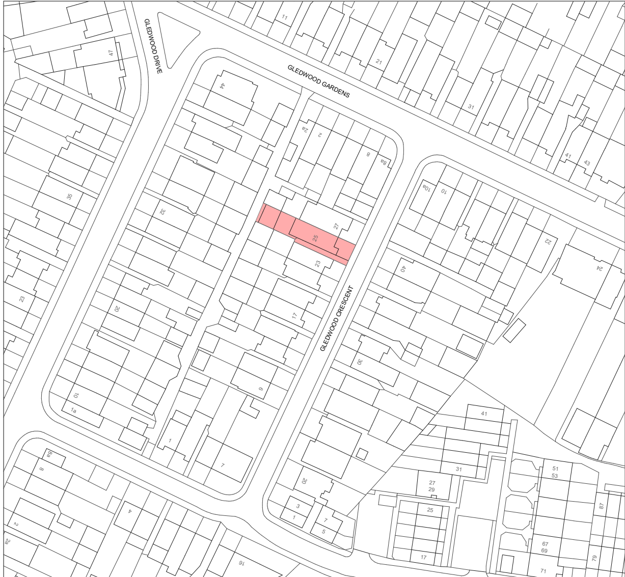
Site Boundary 25 Gledwood Cres.