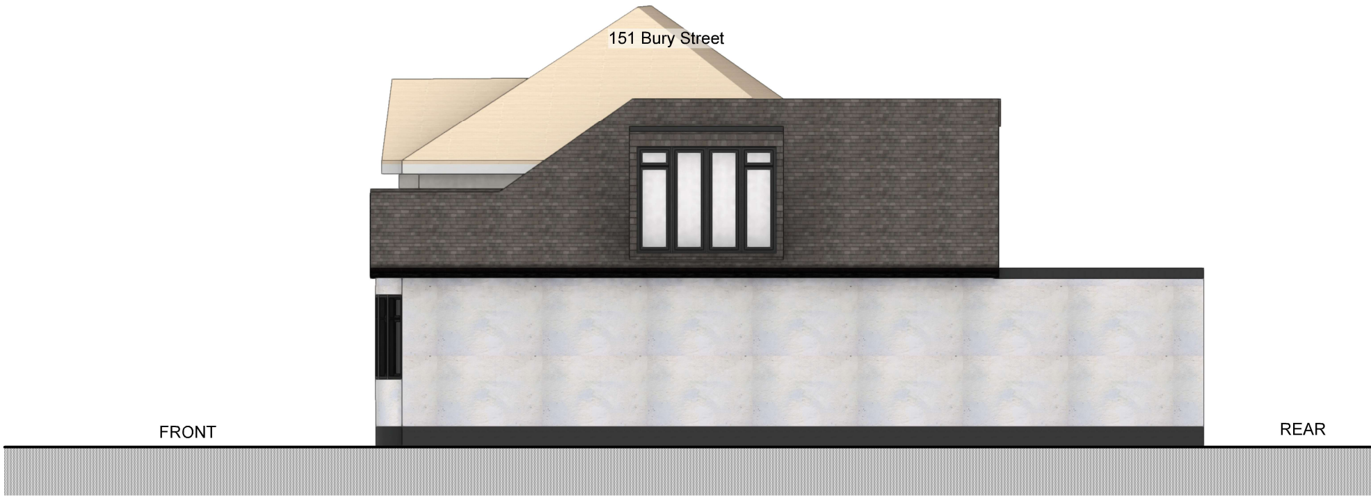
2 02 PROP ELEV SIDE Scale: 1:100