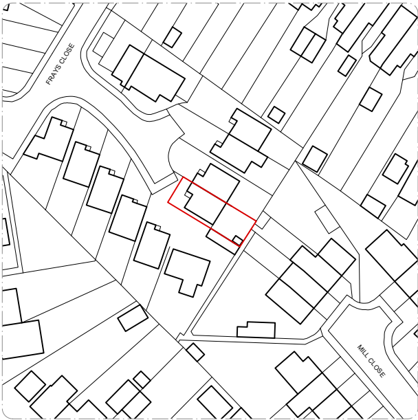
1 Site Location Plan Scale: 1250 @ A3