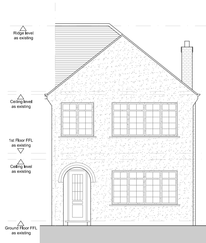
Front Elevation Existing