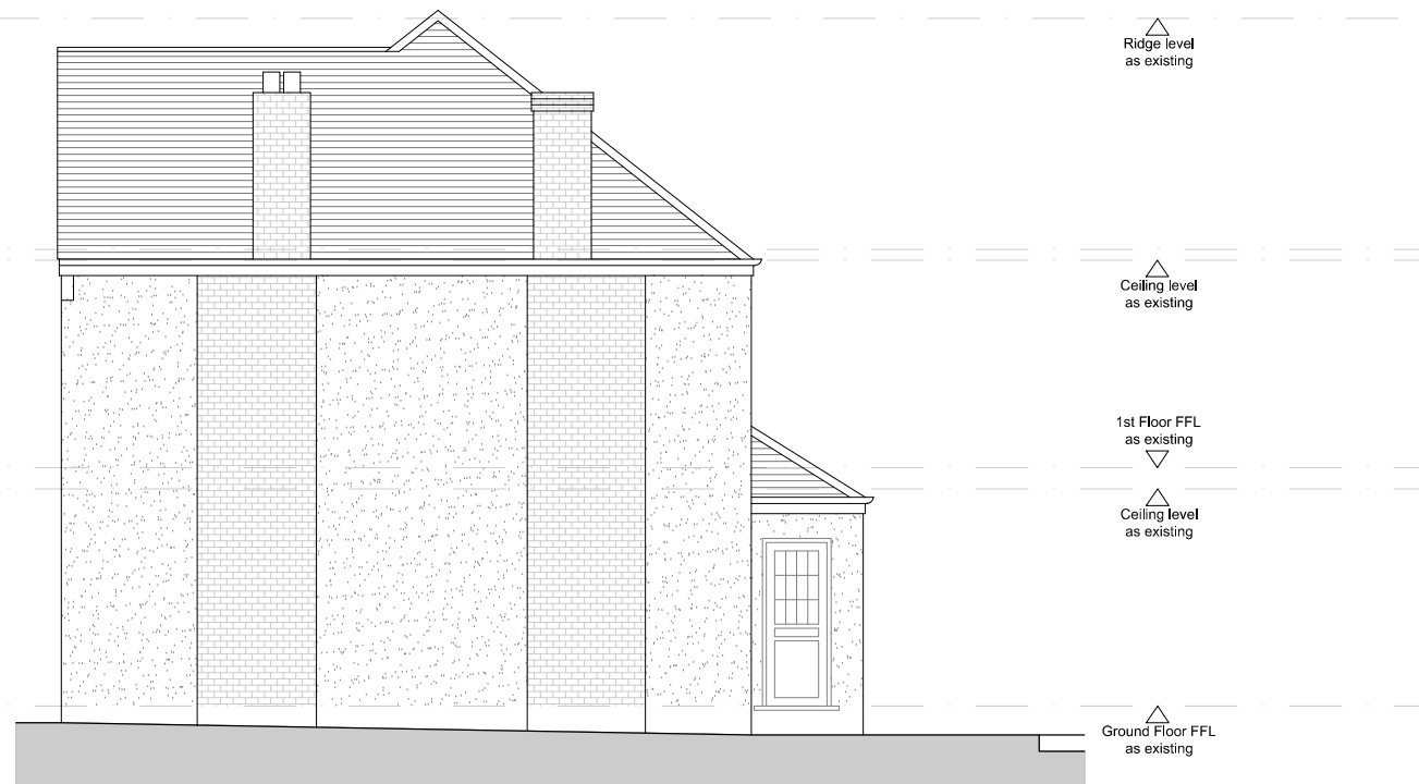
Side Elevation Existing