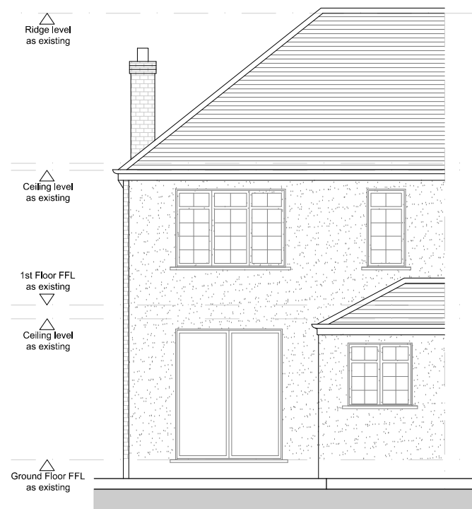
Rear Elevation Existing