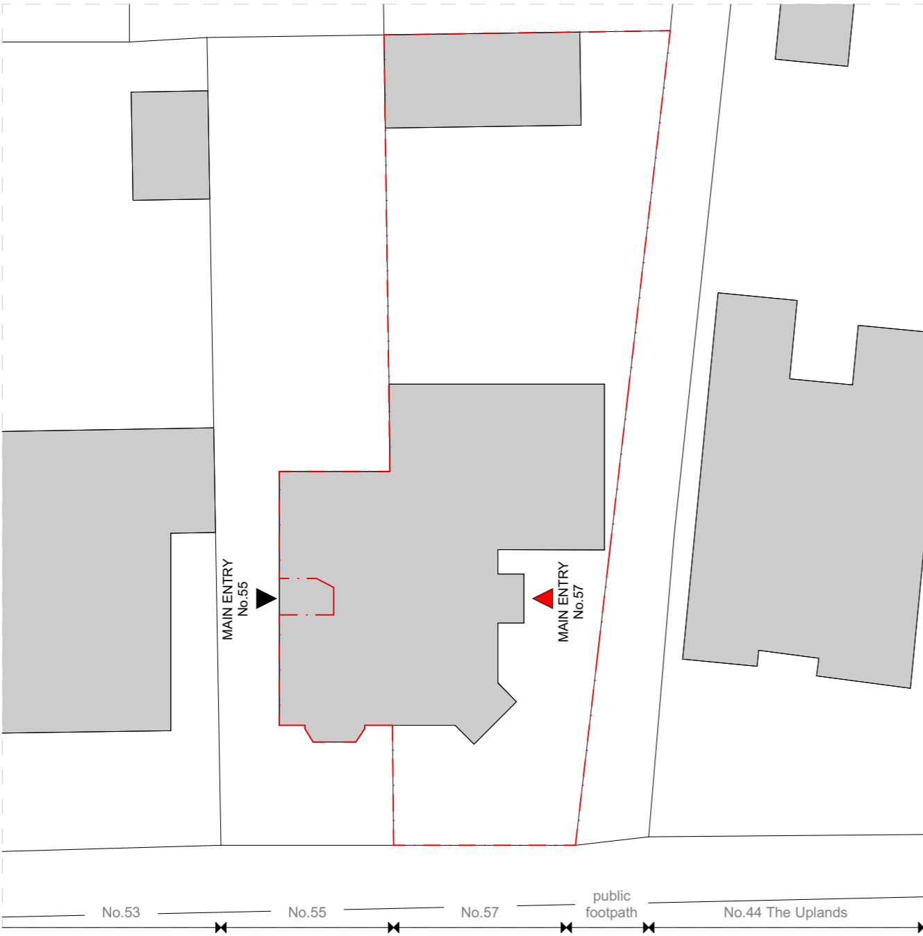
L0 Existing Site Block Plan 1:200