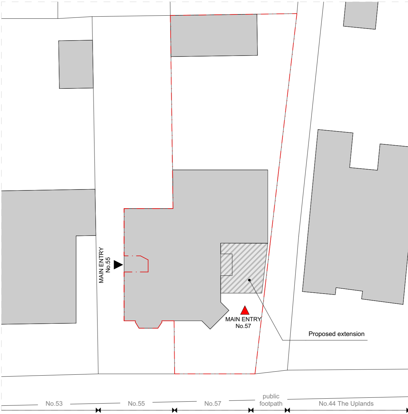
L0 Proposed Site Block Plan 1:200