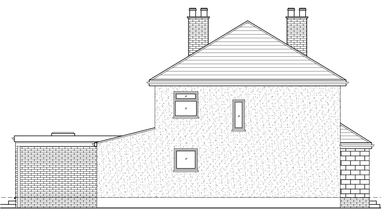
05 - SIDE ELEVATION