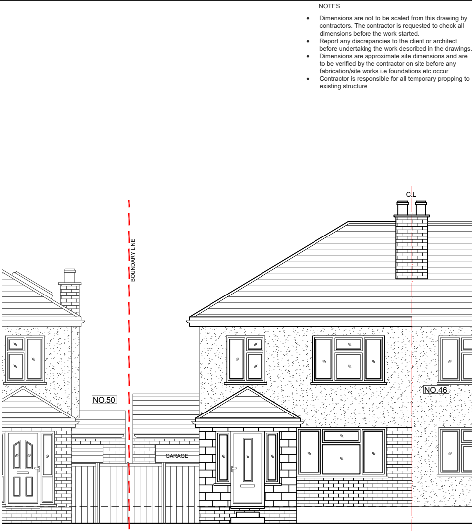
03 - FRONT ELEVATION