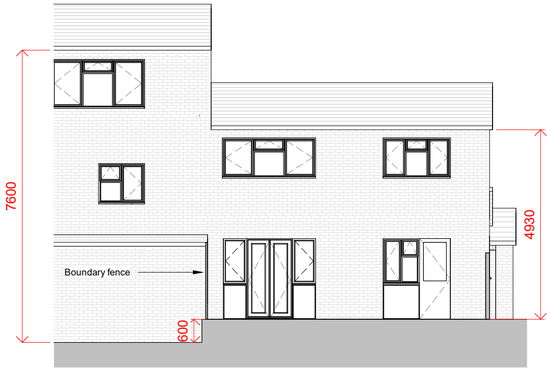
Existing rear elevation Scale - 1 : 100