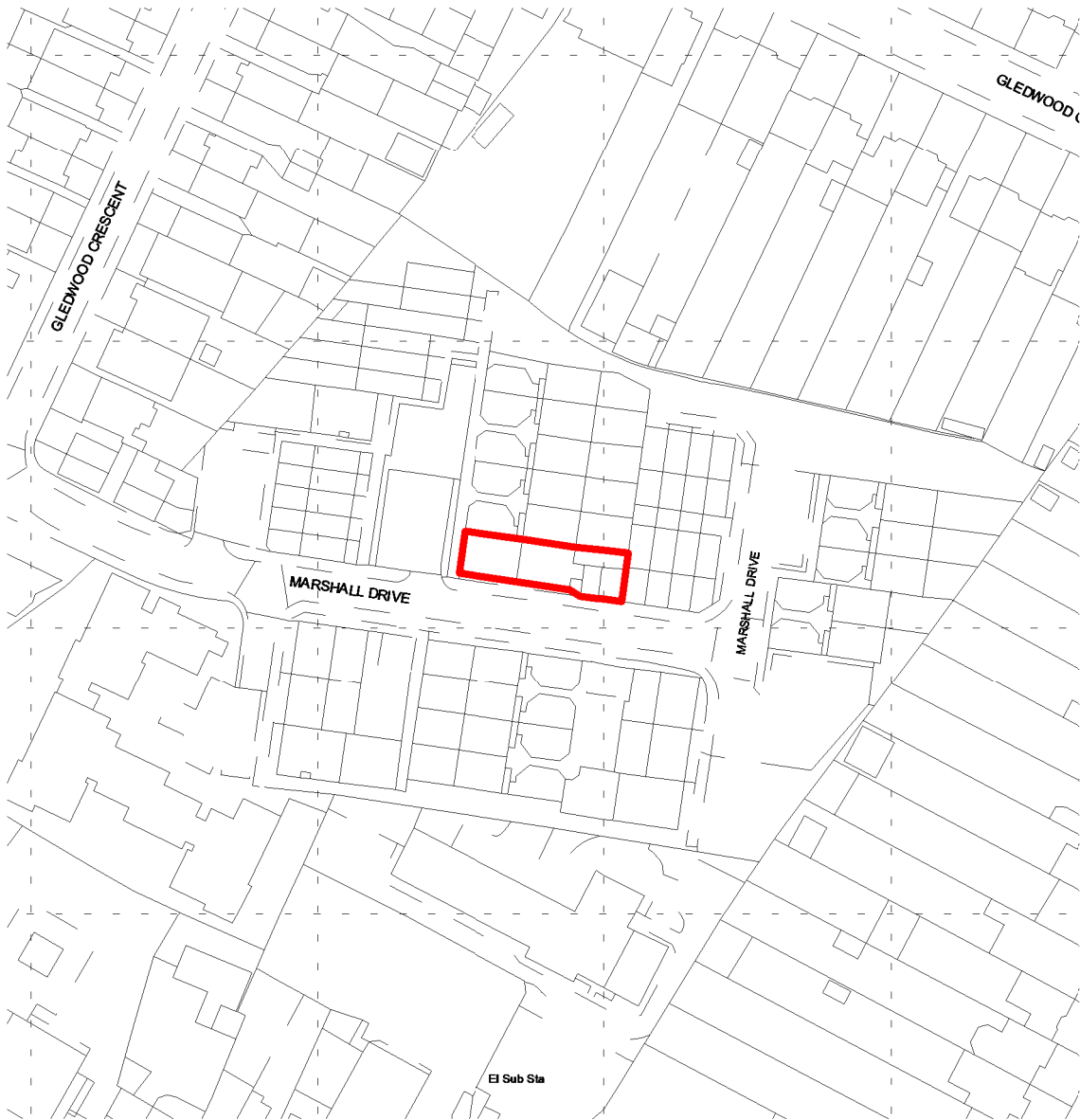
Site plan Scale -1 : 1250

Do not scale this drawing. This drawing is for the approval of planning permission. All dimensions to be checked on site prior to construction. Client to obtain Party Wall notices before commencing work. Contractor to follow all current and relevant Building Regulations and standards for work done. Client / Contractor to obtain Building Control approval and sign off for any work undertaken.