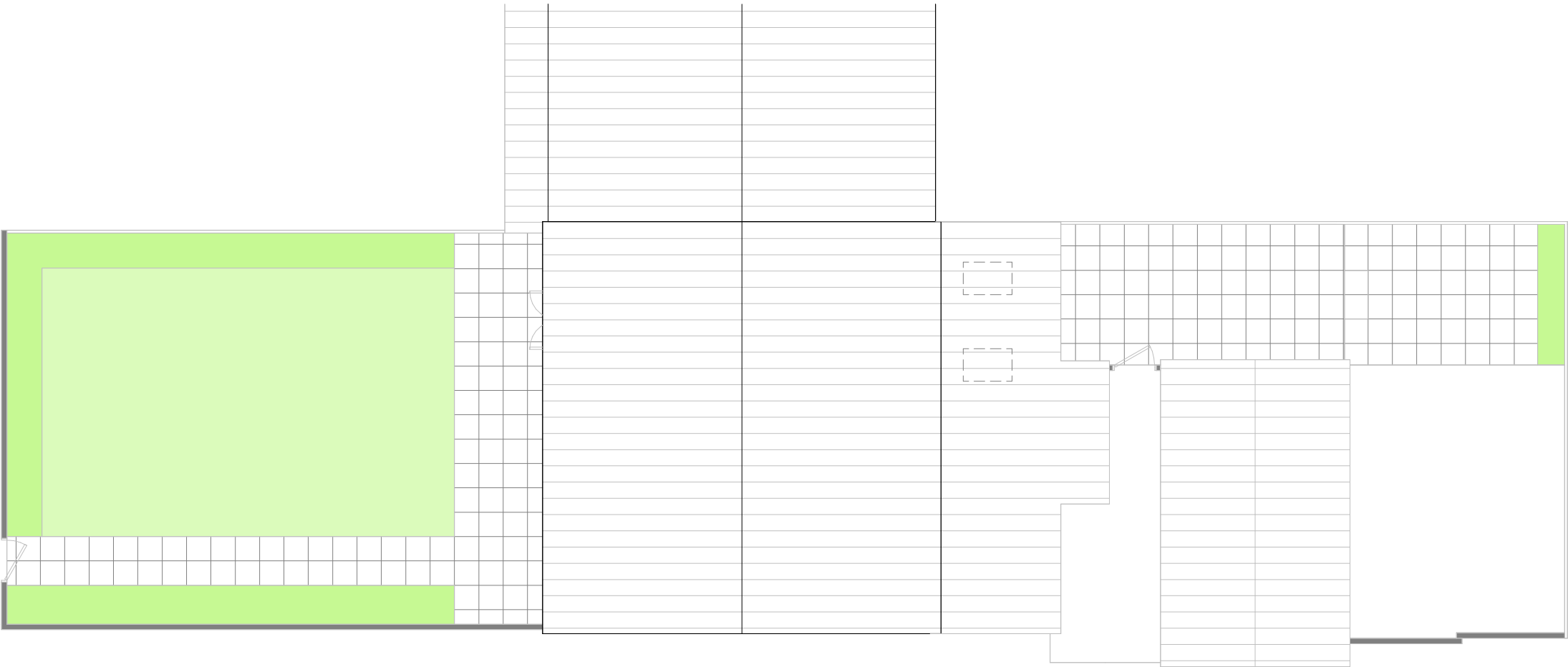
Proposed roof plan Scale - 1 : 100

Do not scale this drawing. This drawing is for the approval of planning permission. All dimensions to be checked on site prior to construction. Client to obtain Party Wall notices before commencing work. Contractor to follow all current and relevant Building Regulations and standards for work done. Client / Contractor to obtain Building Control approval and sign off for any work undertaken.