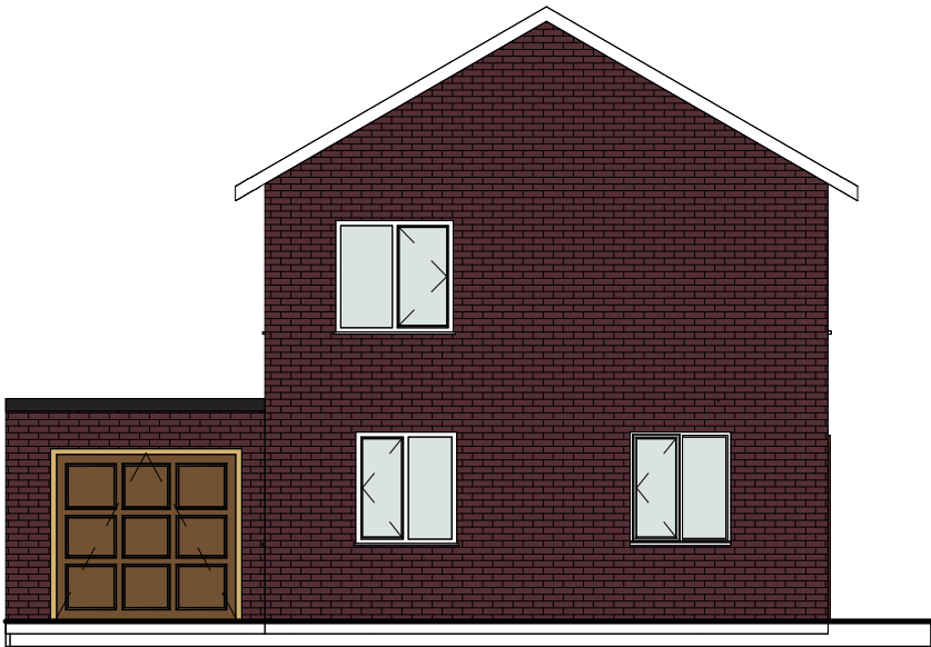
02 - Existing East Elevation

This drawing and all information provided within it is the copyright of DESIGN PLANNING PRACTICE and reproduction without prior consent is strictly forbidden.