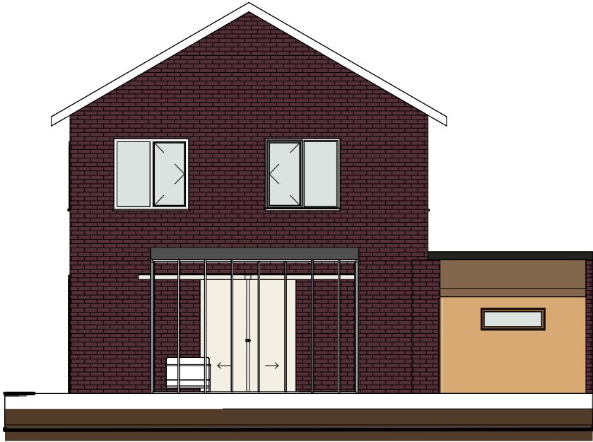
03 - Existing West Elevation