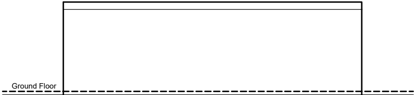
PROPOSED SIDE ELEVATION (A)

MATERIALS USED IN THE CONSTRUCTION OF THE OUTBUILDING WILL MATCH THE MAIN DWELLING