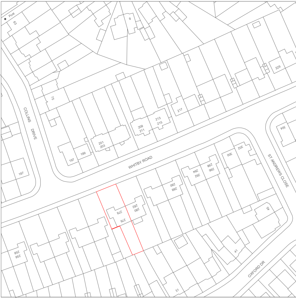
01 LOCATION PLAN