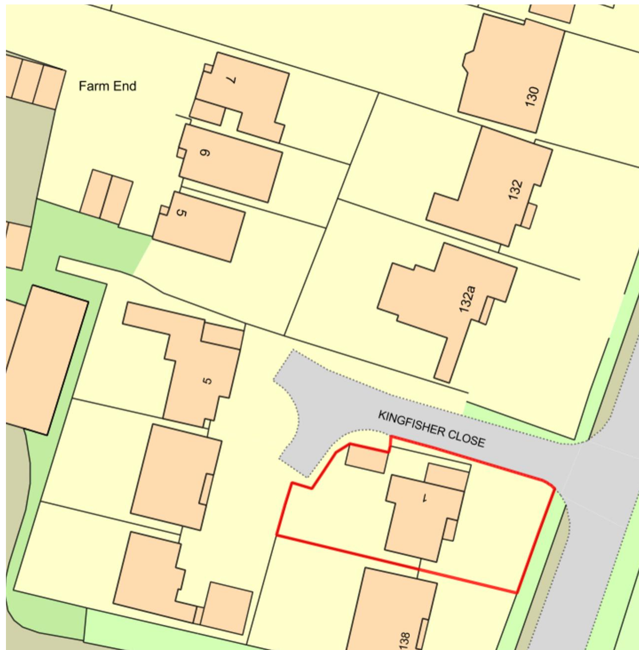
Existing Block Plan (Scale: 1:500)