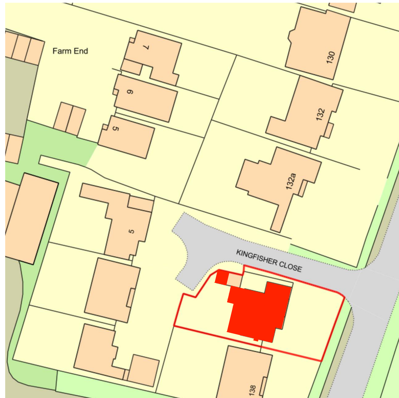
Proposed Block Plan (Scale: 1:500)