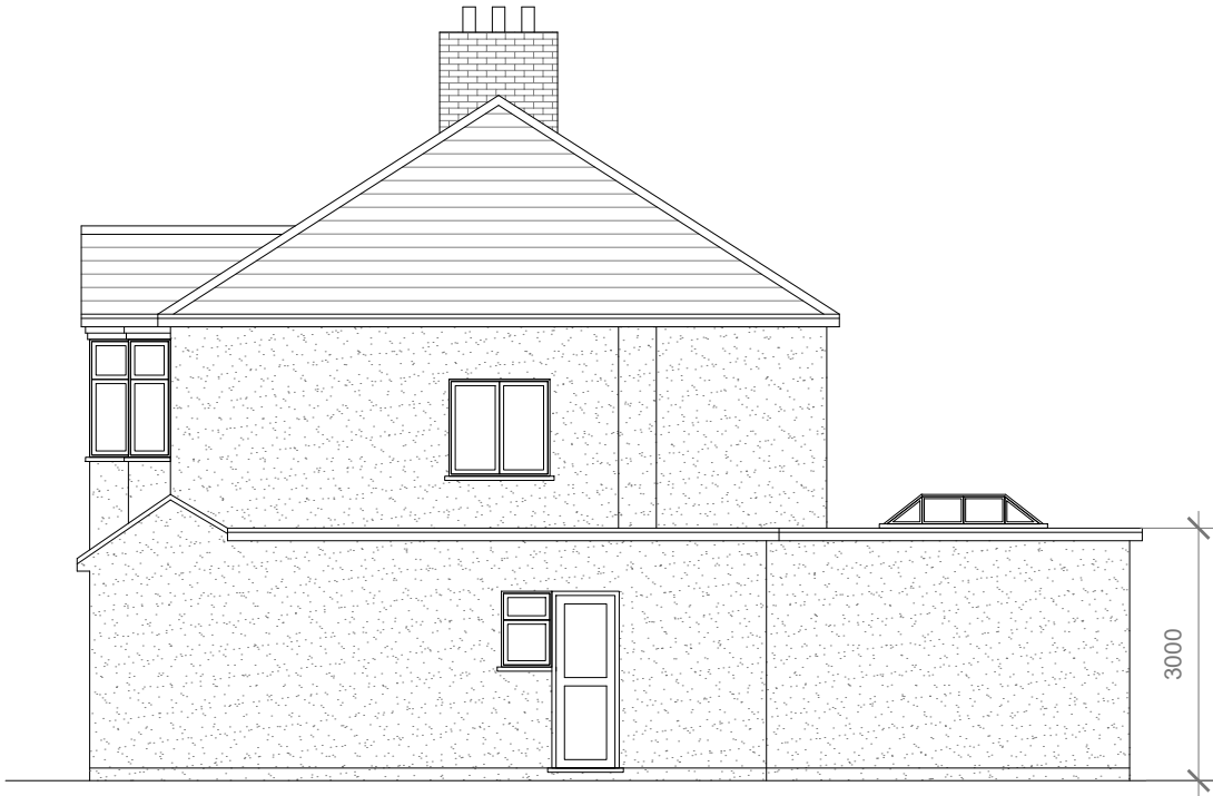
Proposed Side Elevation Scale 1:100