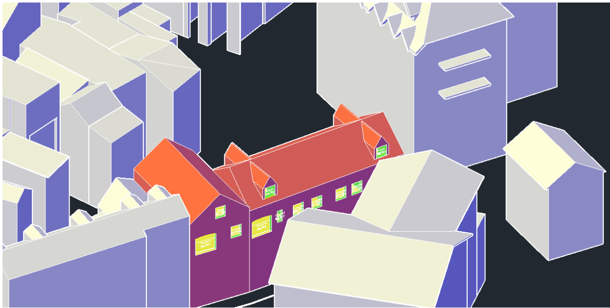
Fig. 1 – Image of the CPMC model (terrain not shown)

The property is located on the south side of Green Lane, behind an existing row of terraces and to the north of Anthus Mews.