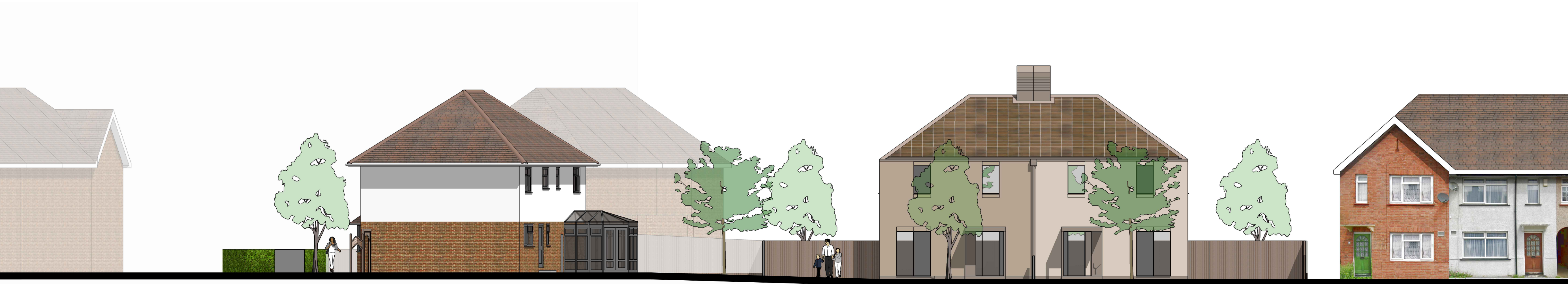
SOUTH ELEVATION ONTO ASH GROVE