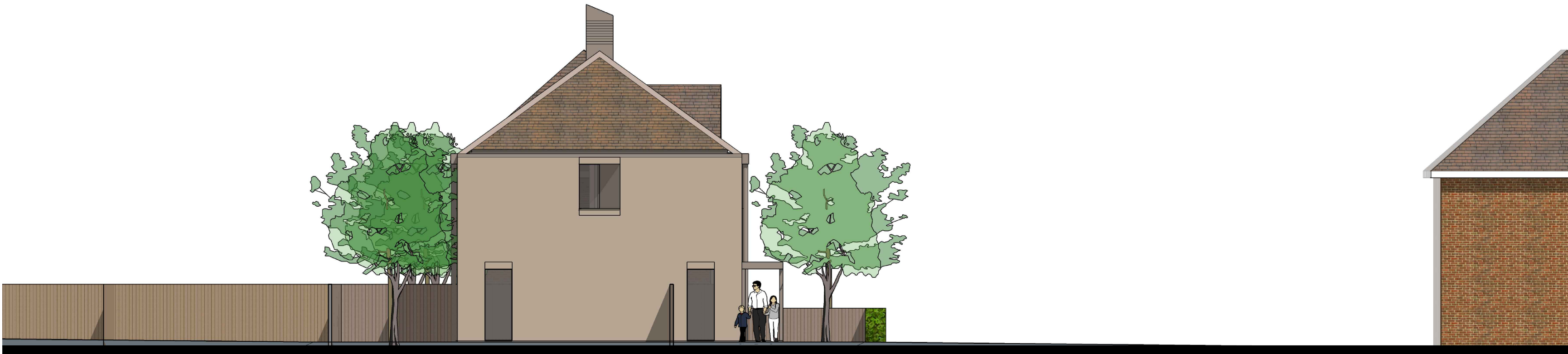
WEST ELEVATION (SIDE)