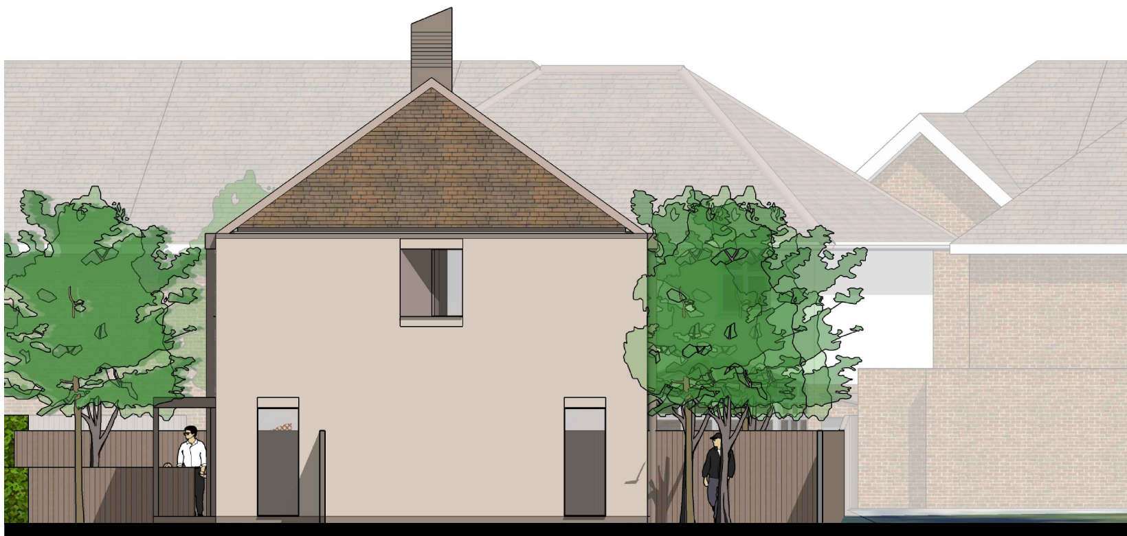
EAST ELEVATION (SIDE)

Note: All materials and colours subject to planning condition