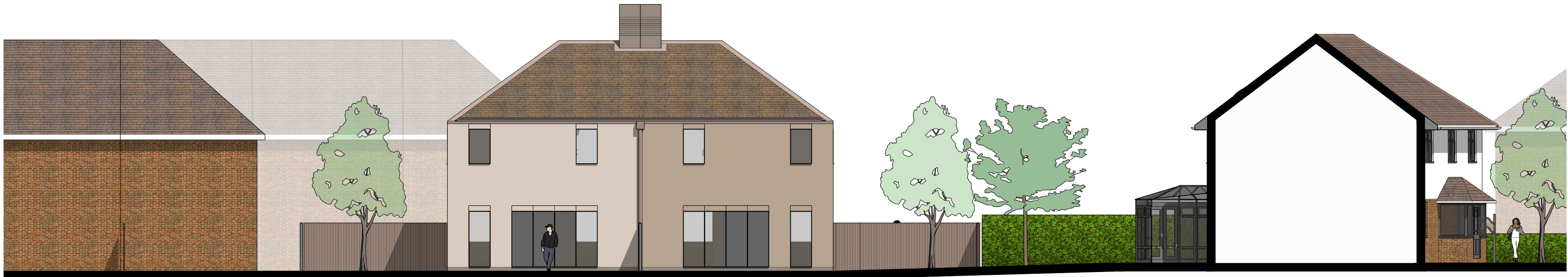
NORTH ELEVATION (GARDEN)