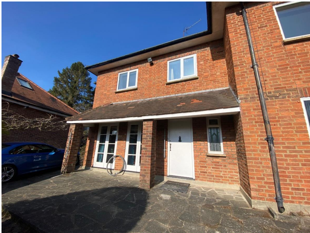
Rear elevation view from curtilage/garden