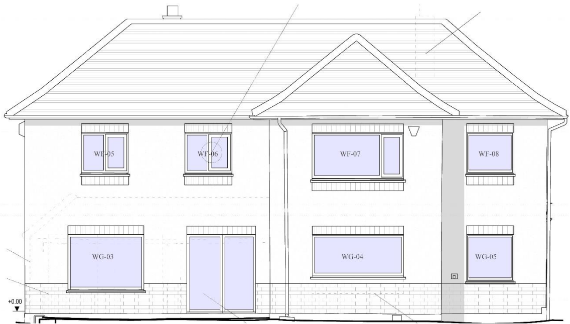
Proposed front and rear elevation views