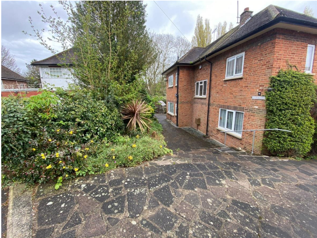
Front elevation view from Merle Avenue