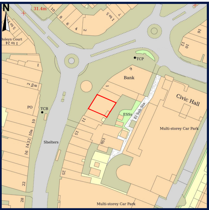
LOCATION PLAN - 1:1250 @ A1