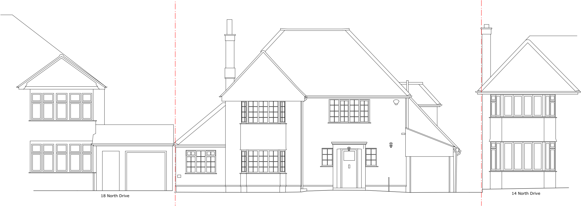
Front Elevation - No Change