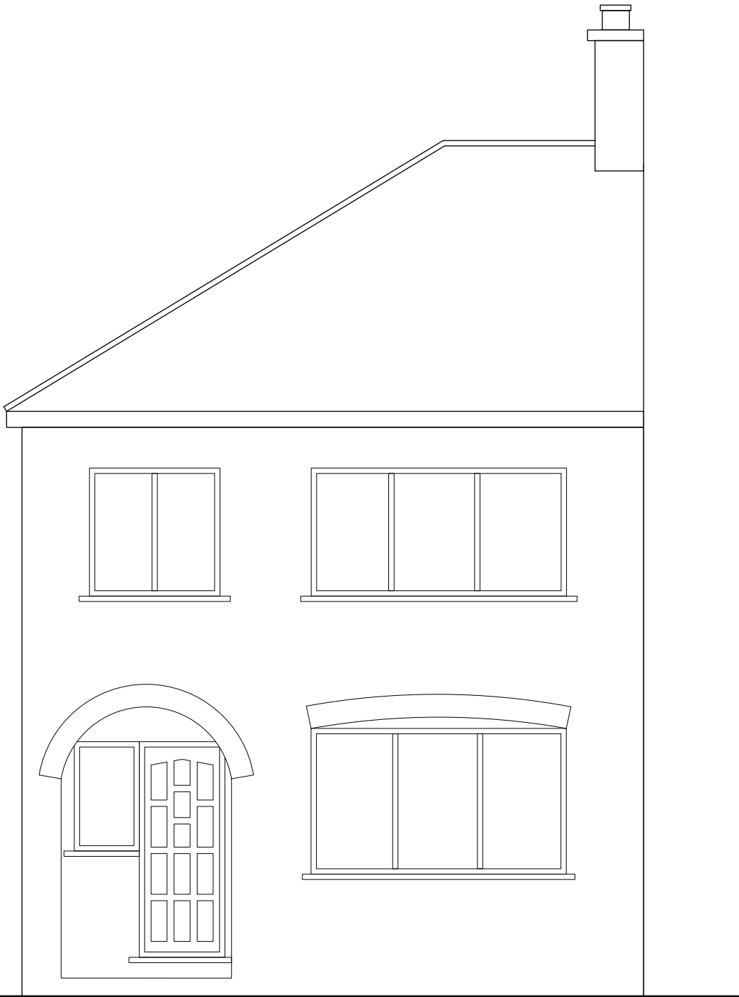
1 South Elevation Scale: 1:50