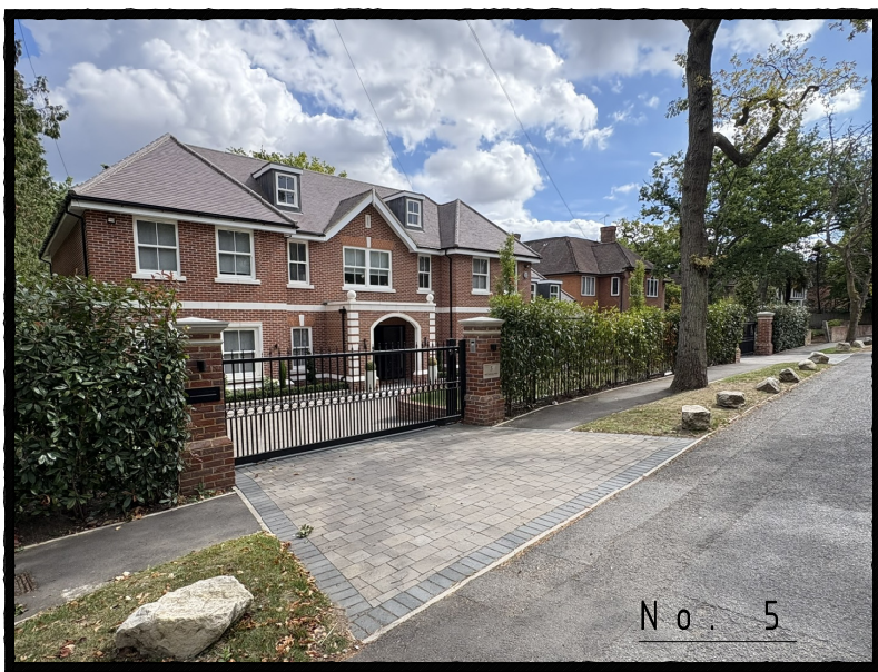
EXAMPLES OF GATES AND RAILINGS ALONG NICHOLAS WAY