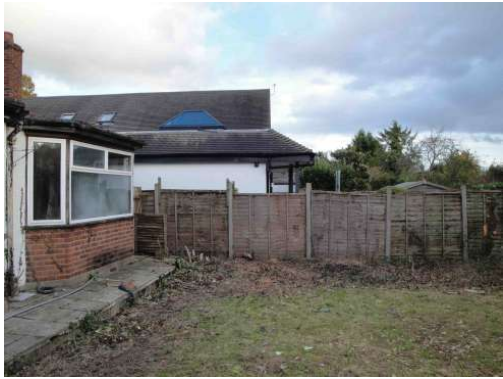
Rear view looking at number 35

Telephone: 01895 235089 - E-mail: michaeloakesarchitect@googlemail.com