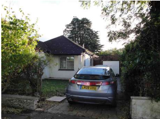
Existing hardstanding kept