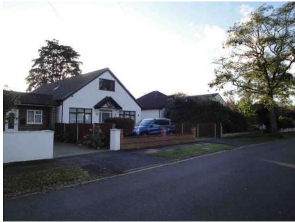
Other extensions on Halford Road