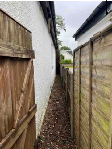
View of side flank looking towards road