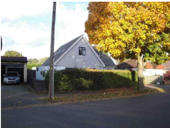
Other extensions on Halford Road (raised ridge)