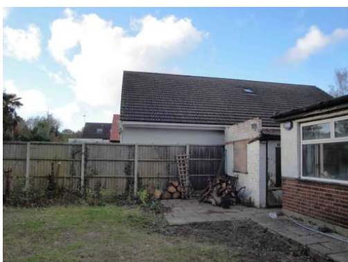
Rear view looking at number 39