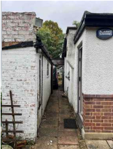
Views from Rear Garden looking towards street