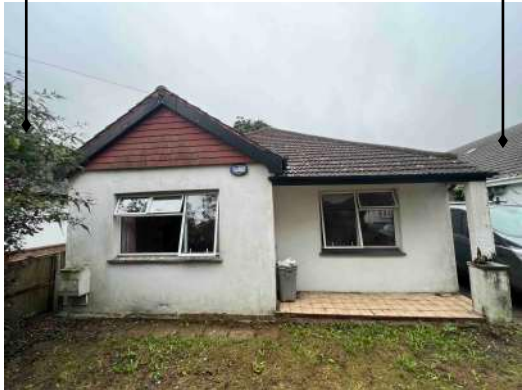
Existing Views from Front Garden