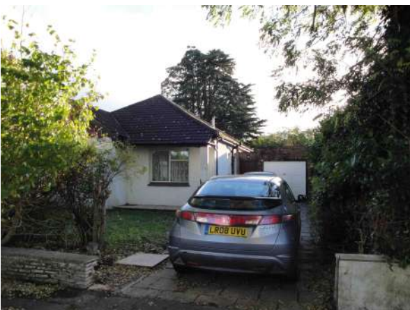
Views from Halford Road number 37