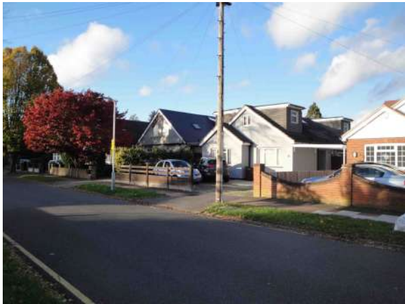
Other extensions on Halford Road