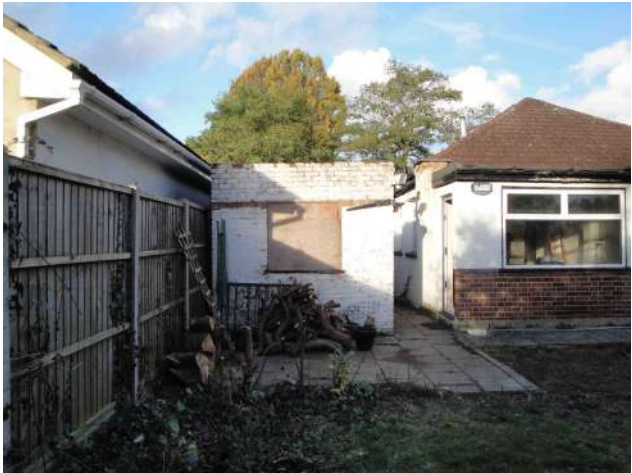
Existing rear garage (proposed removed)