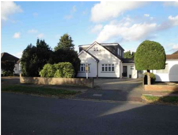
Other extensions on Halford Road