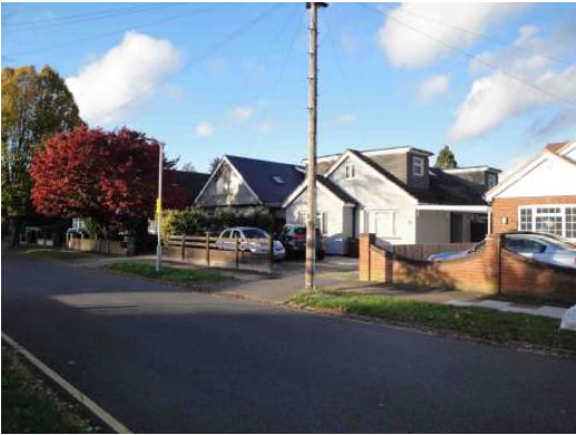
Views from Halford Road