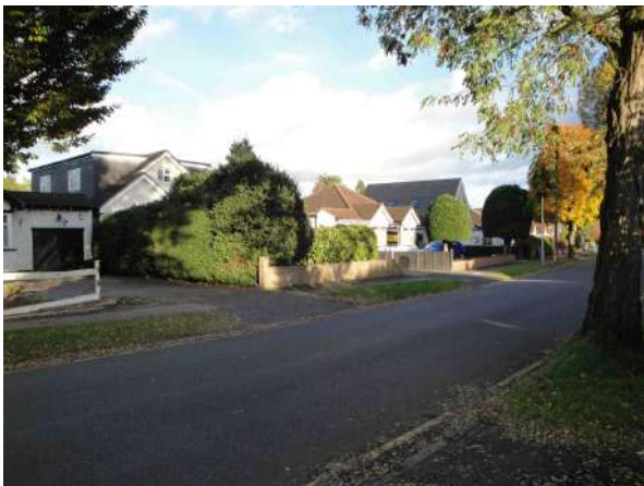
Other extensions on Halford Road