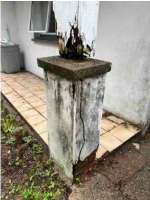
Front canopy post detail proposed kept