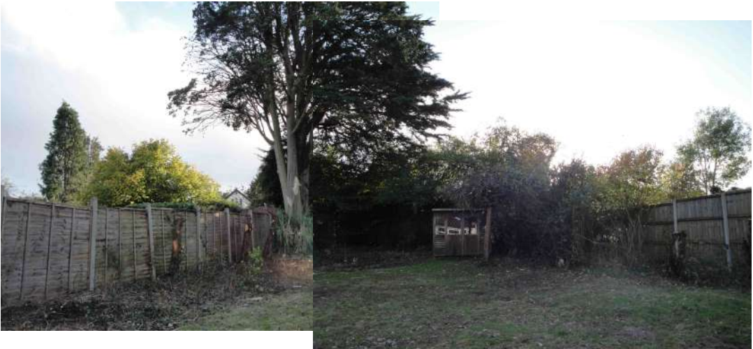
View of rear garden from rear patio