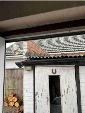
Garage door looking towards number 35