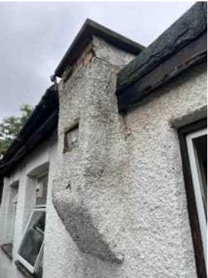
Obsolete chimney proposed removed