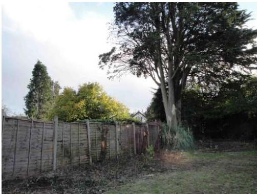
Rear view looking down garden