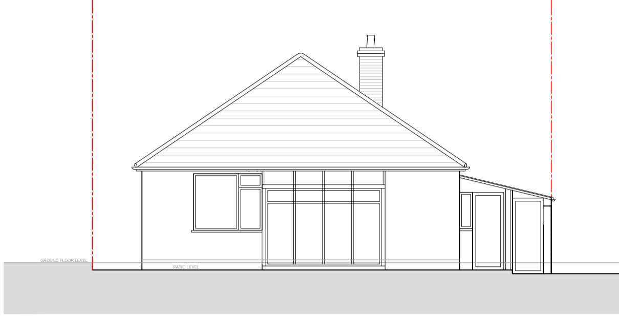
EXISTING SOUTH ELEVATION SCALE 1 : 100