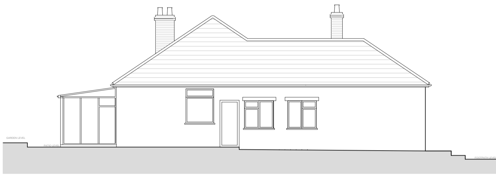
EXISTING EAST ELEVATION SCALE 1 : 100