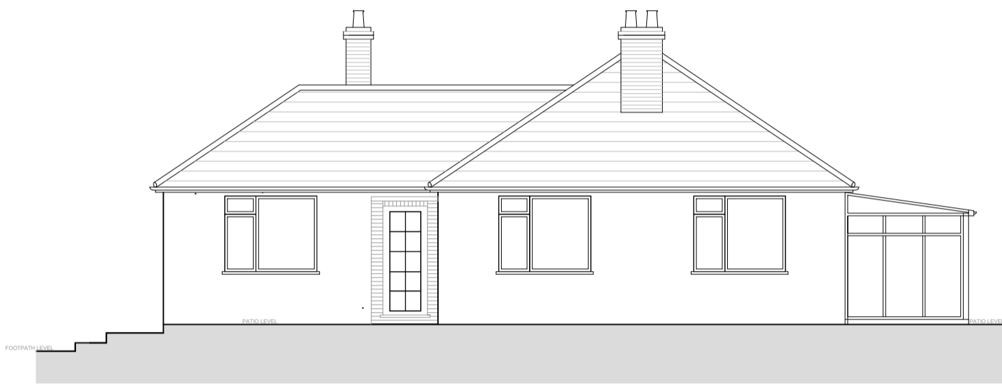
EXISTING WEST ELEVATION SCALE 1 : 100