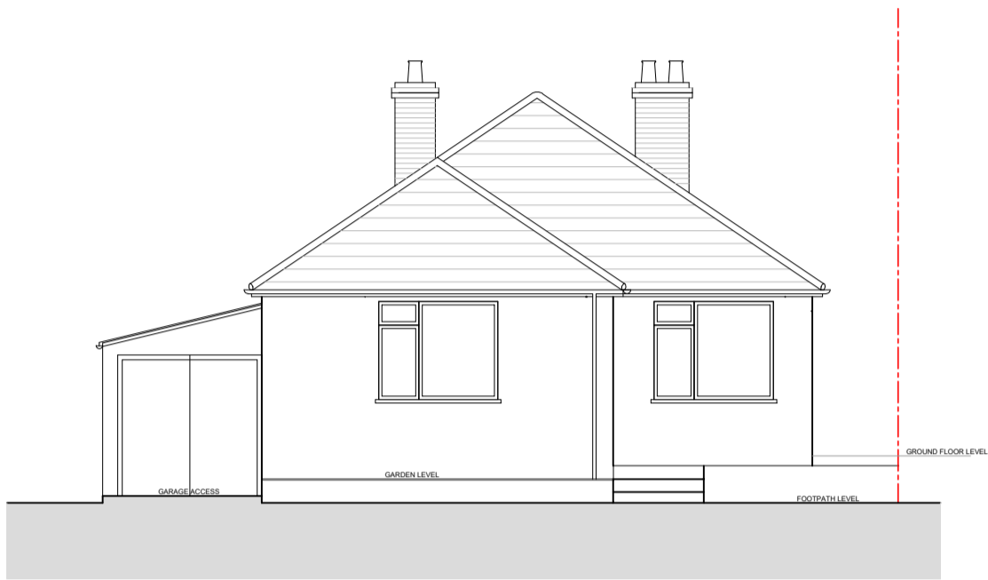
EXISTING NORTH ELEVATION SCALE 1 : 100

THIS DRAWING IS TO BE READ IN CONJUNCTION WITH ALL OTHER DRAWINGS AND DOCUMENTS PROVIDED. THE CONTRACTOR MUST CHECK ALL DIMENSIONS ON SITE BEFORE PLACING ORDERS FOR MATERIALS OR SHOP FABRICATIONS OR COMMENCING WORKS ON SITE. ANY DISCREPANCIES SHOULD BE NOTIFIED BEFORE PROCEEDING.