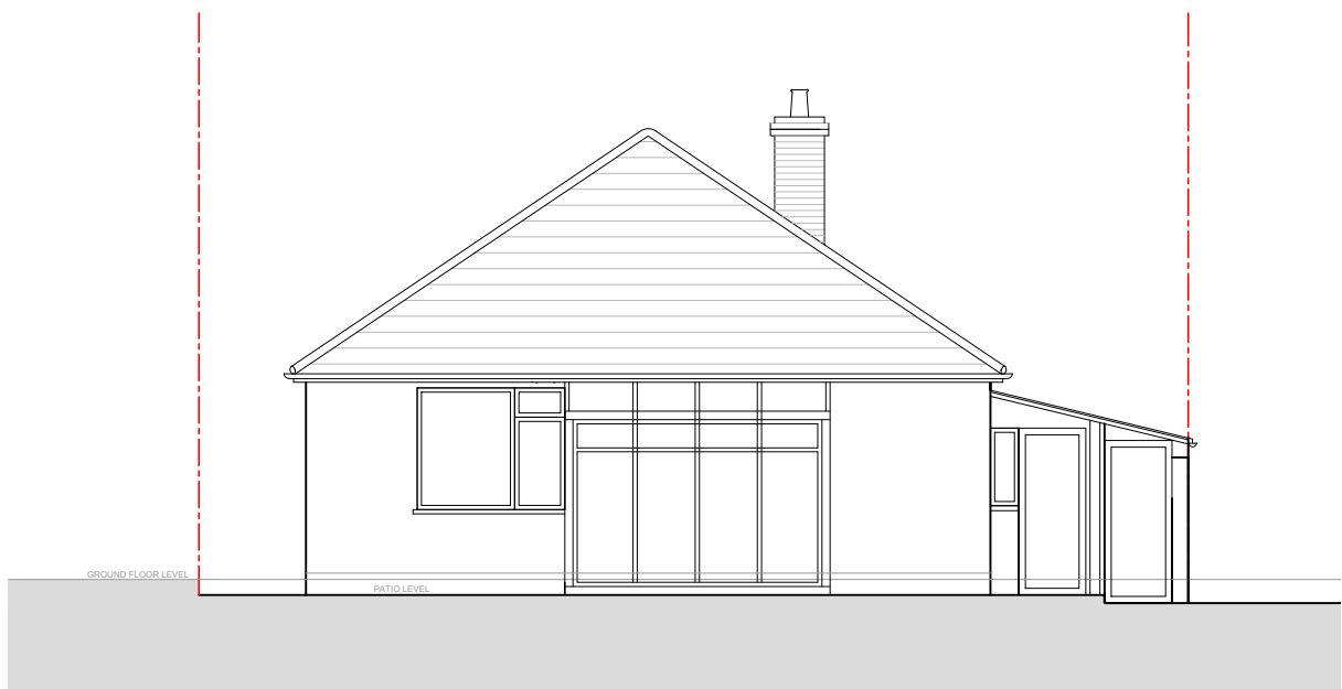
EXISTING SOUTH ELEVATION SCALE 1 : 100