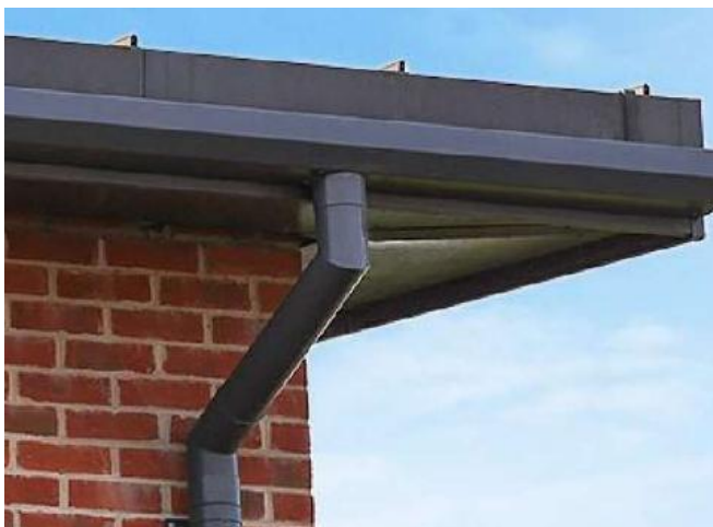
Fascias, soffits and gutters