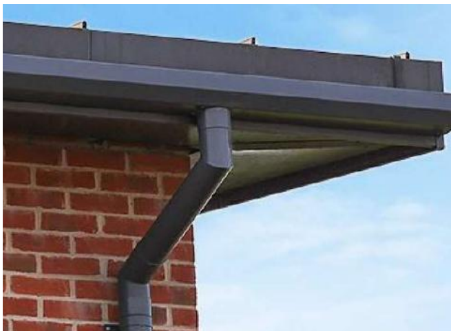
Fascias, soffits and gutters