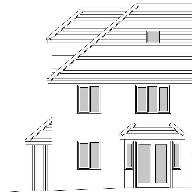
FRONT (NORTH) ELEVATION