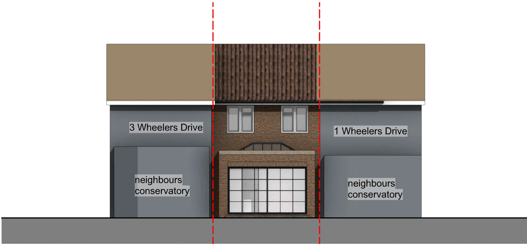
02 02 PROP ELEV REAR Scale: 1:100