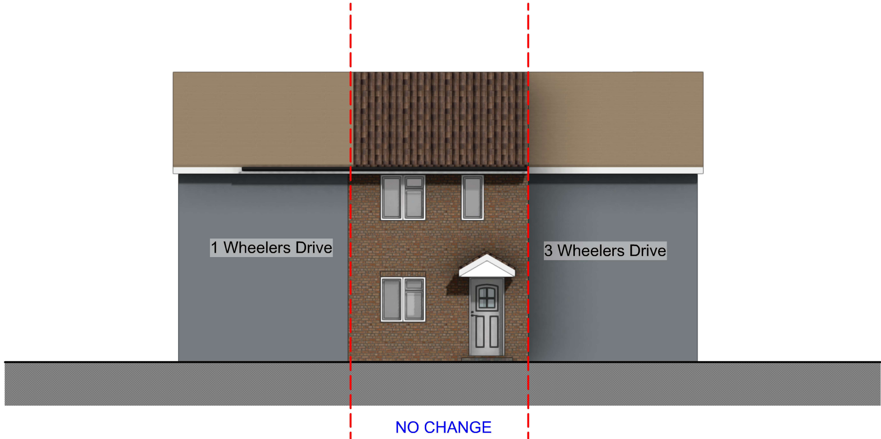
01 01 PROP ELEV FRONT Scale: 1:100