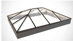
ROOF LANTERN over flat roof KORNICHE or similar slim line aluminium roof lantern

To be double glazed + to meet 'U' value of min. 2.0 W/m sq.K. All roof lights to be A-A fire rated. Fully thermally broken construction. Double up rafters on the side of opening, supporting double trimmers above & below opening. Bolt together with M12 bolts at 450 c/s. Must be 450mm minimum clear opening with non opening fasteners. Fixed in accordance with the manufacturers instructions.