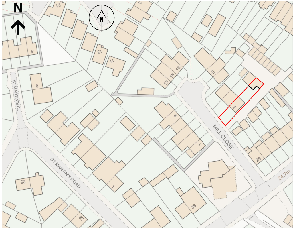
01 - OS MAP SCALE 1:1250