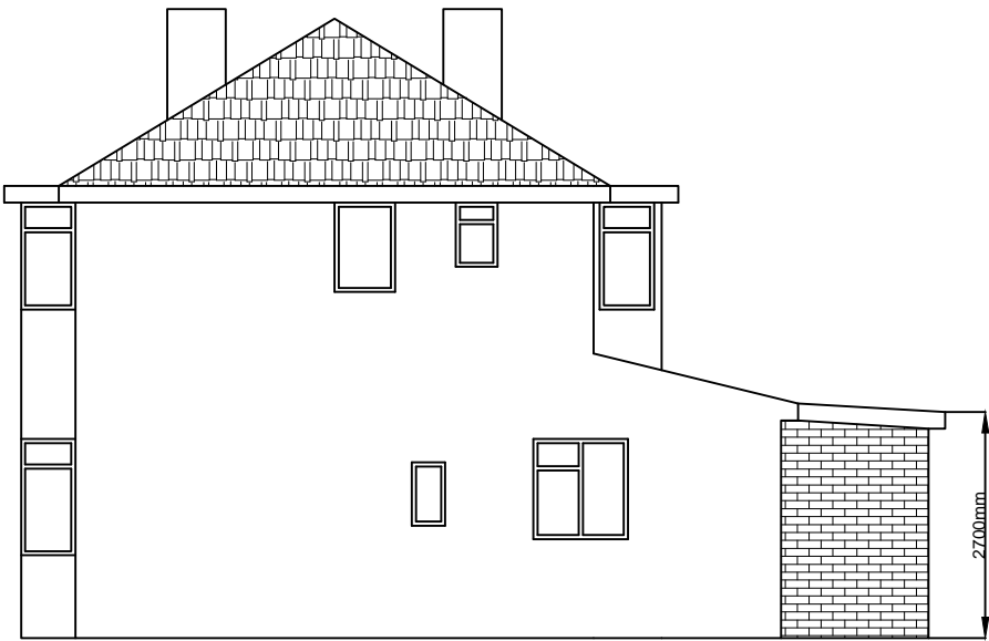
PROPOSED SIDE ELEVATIONS