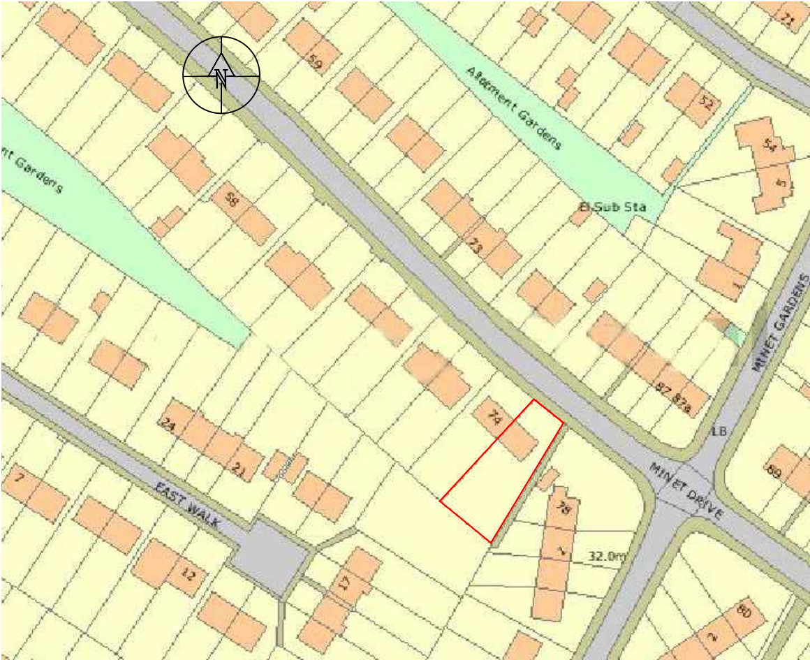
01 - OS MAP