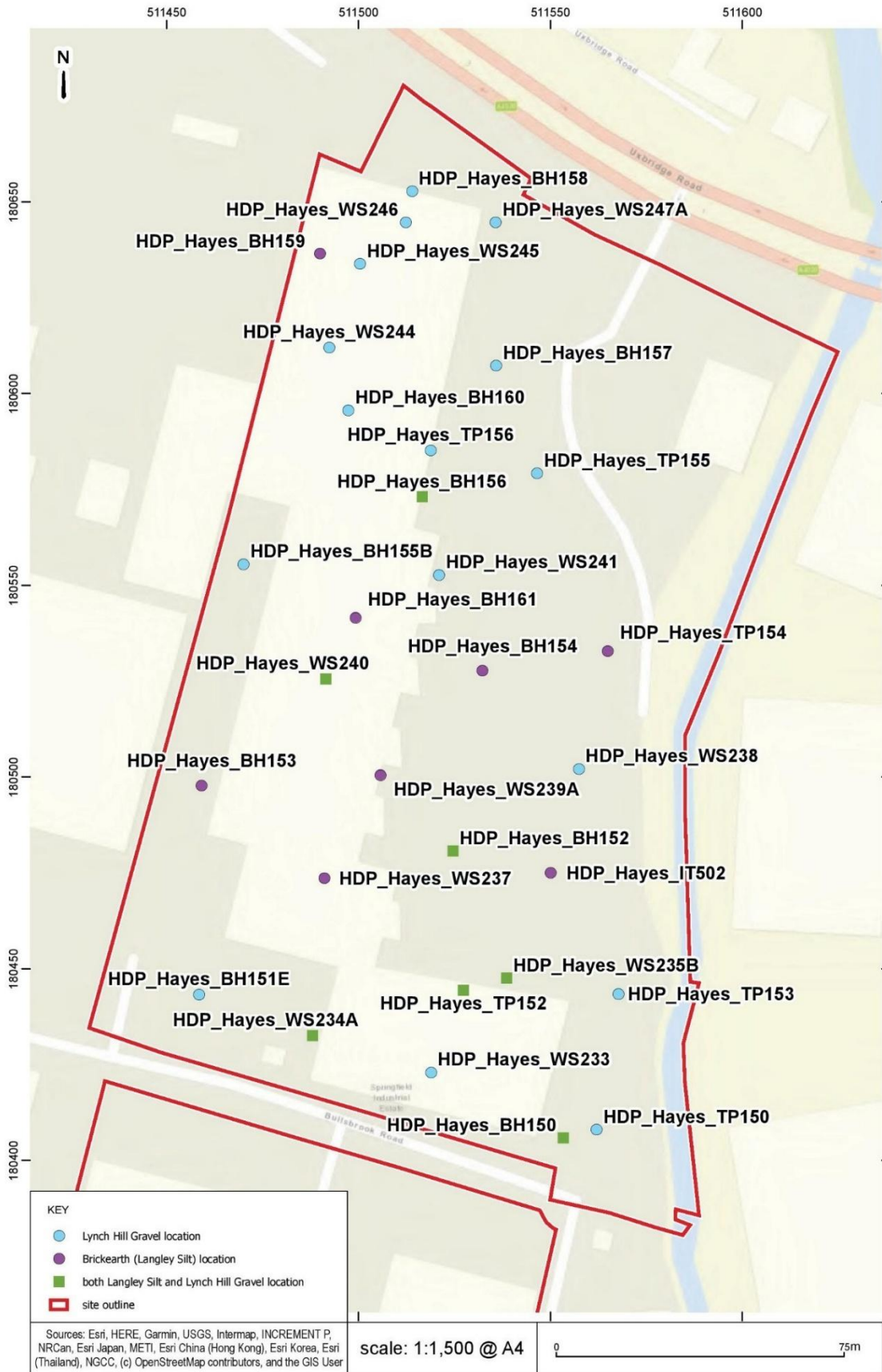
Fig 4 Lagley Silt and Lynch Hill Gravel locations

Geoarchaeological watching brief