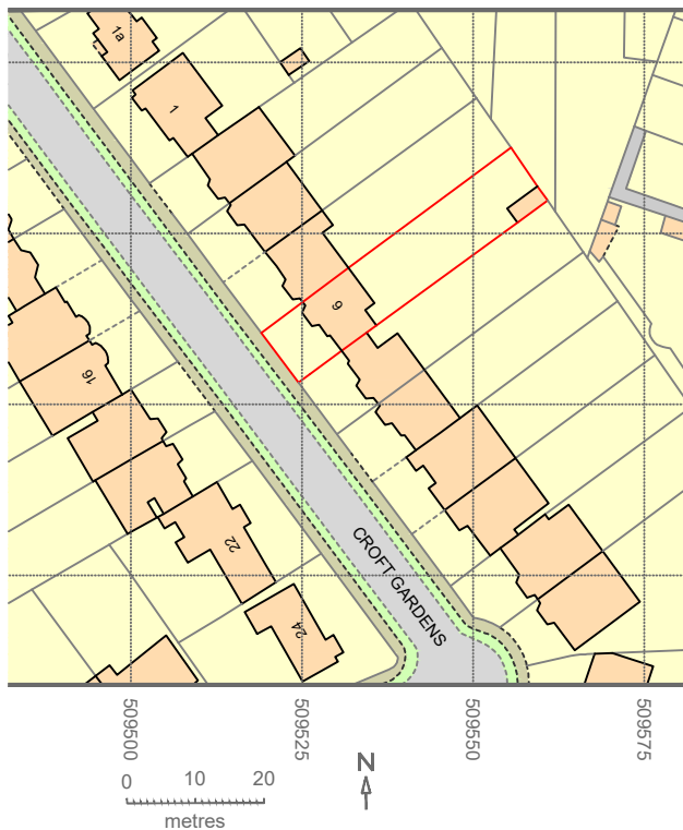
Site plan (1:1250)