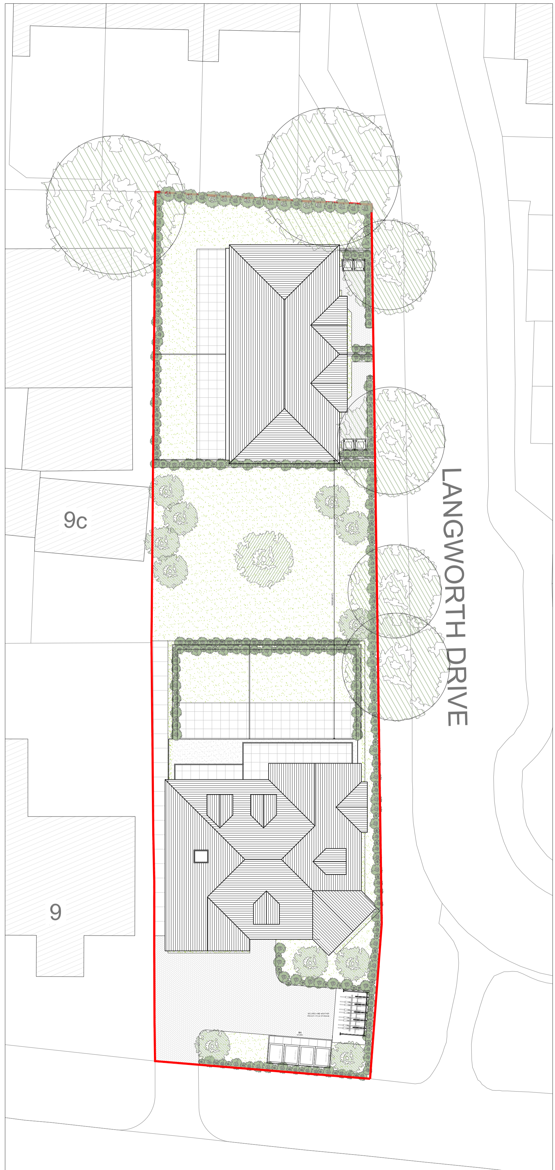
PROPOSED BLOCK PLAN SCALE 1:150