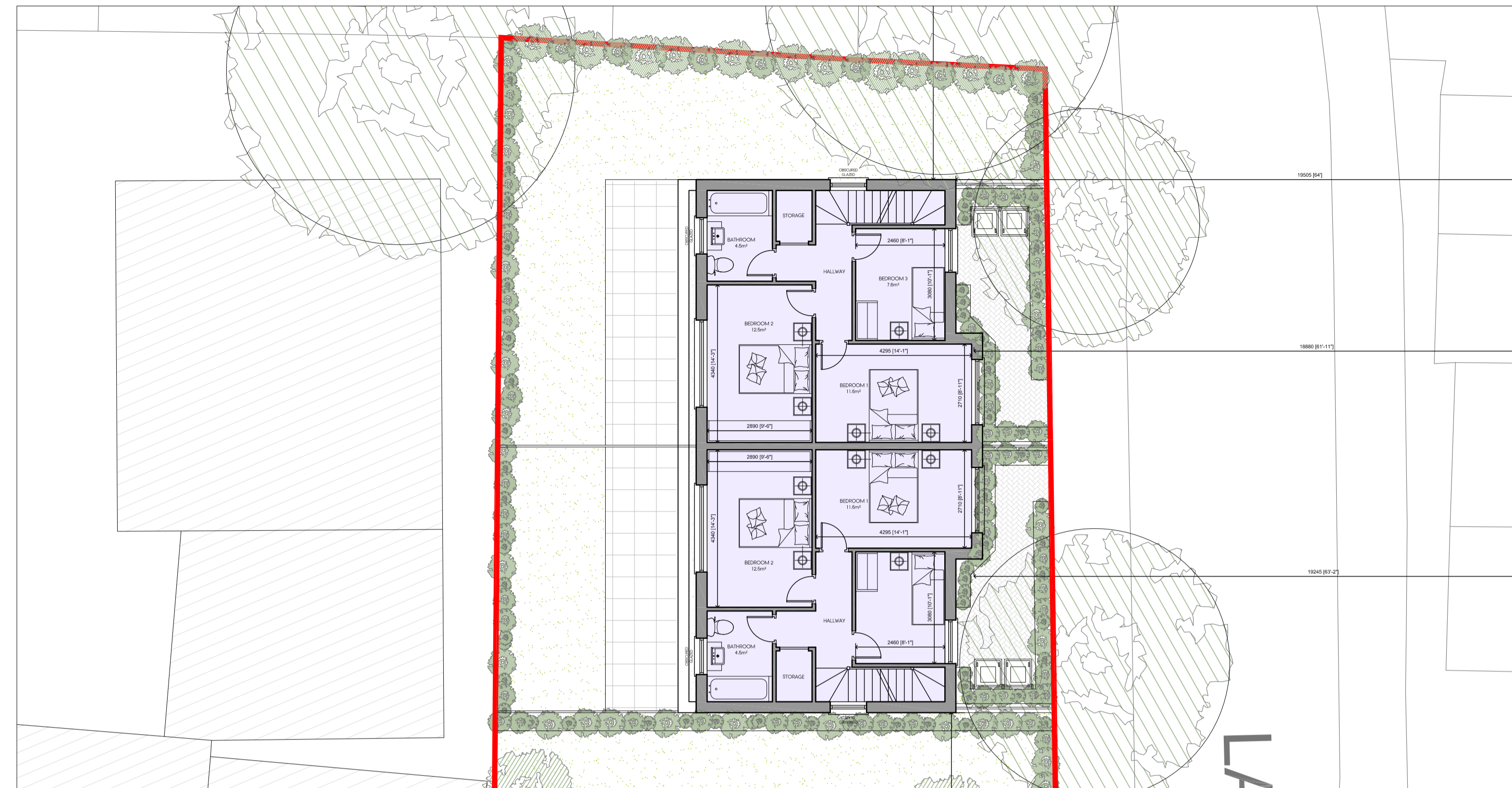
PROPOSED FIRST FLOOR PLAN - BACK BUILDING SCALE 1:100