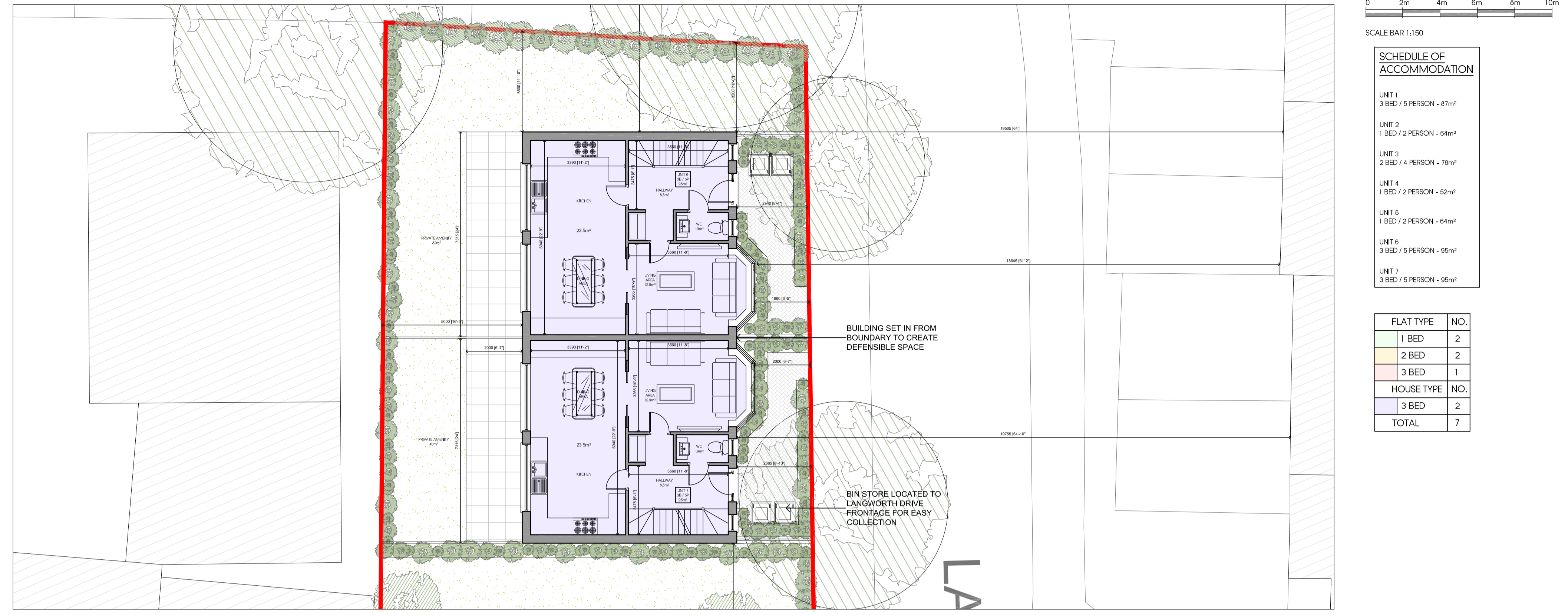
PROPOSED GROUND FLOOR PLAN - BACK BUILDING SCALE 1:100