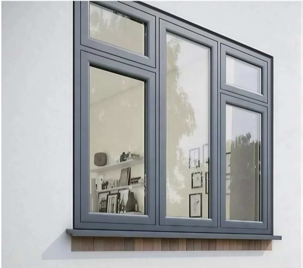
First Floor concrete blocks with white K Render