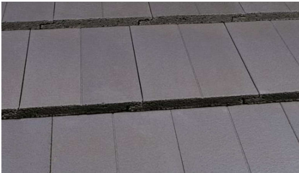
Modern interlocking concrete roof tile