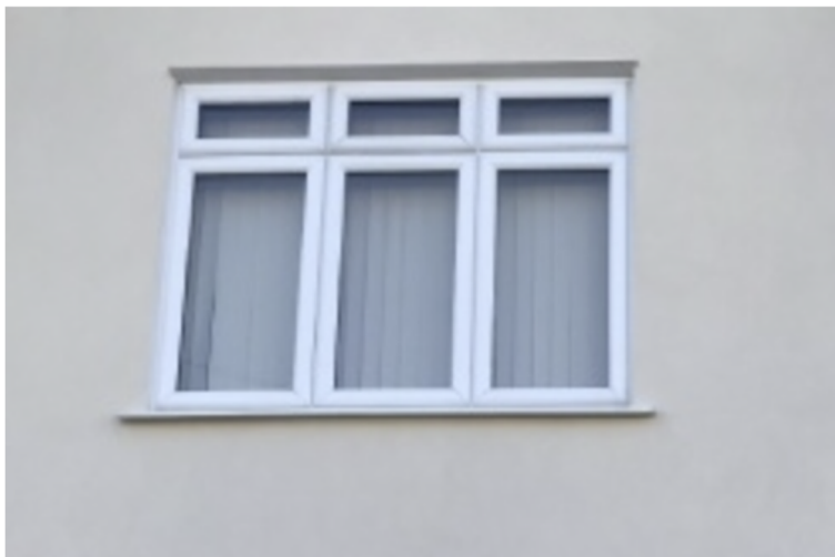
First Floor concrete blocks with white K Render