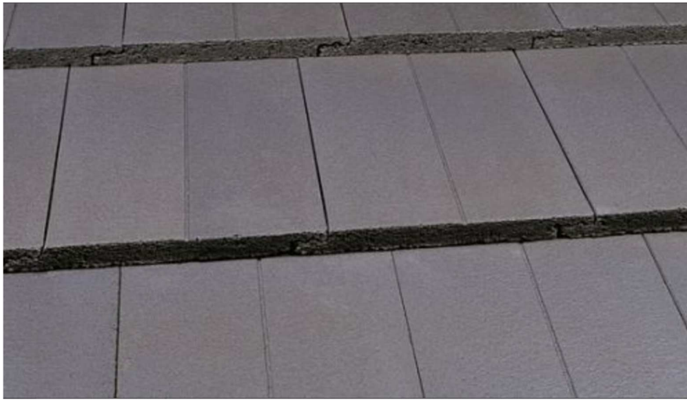
Modern interlocking concrete roof tile