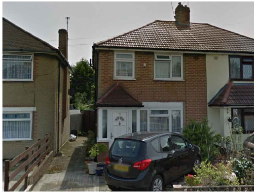
01 - FRONT VIEW