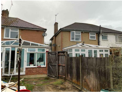
03 - REAR VIEW