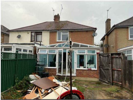
02 - REAR VIEW