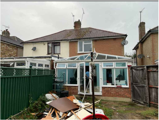
05 - REAR VIEW