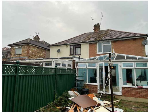
04 - REAR VIEW