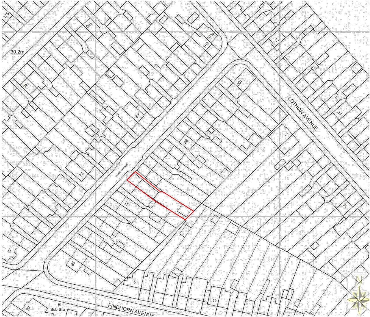
06 - OS MAP SCALE 1:1250