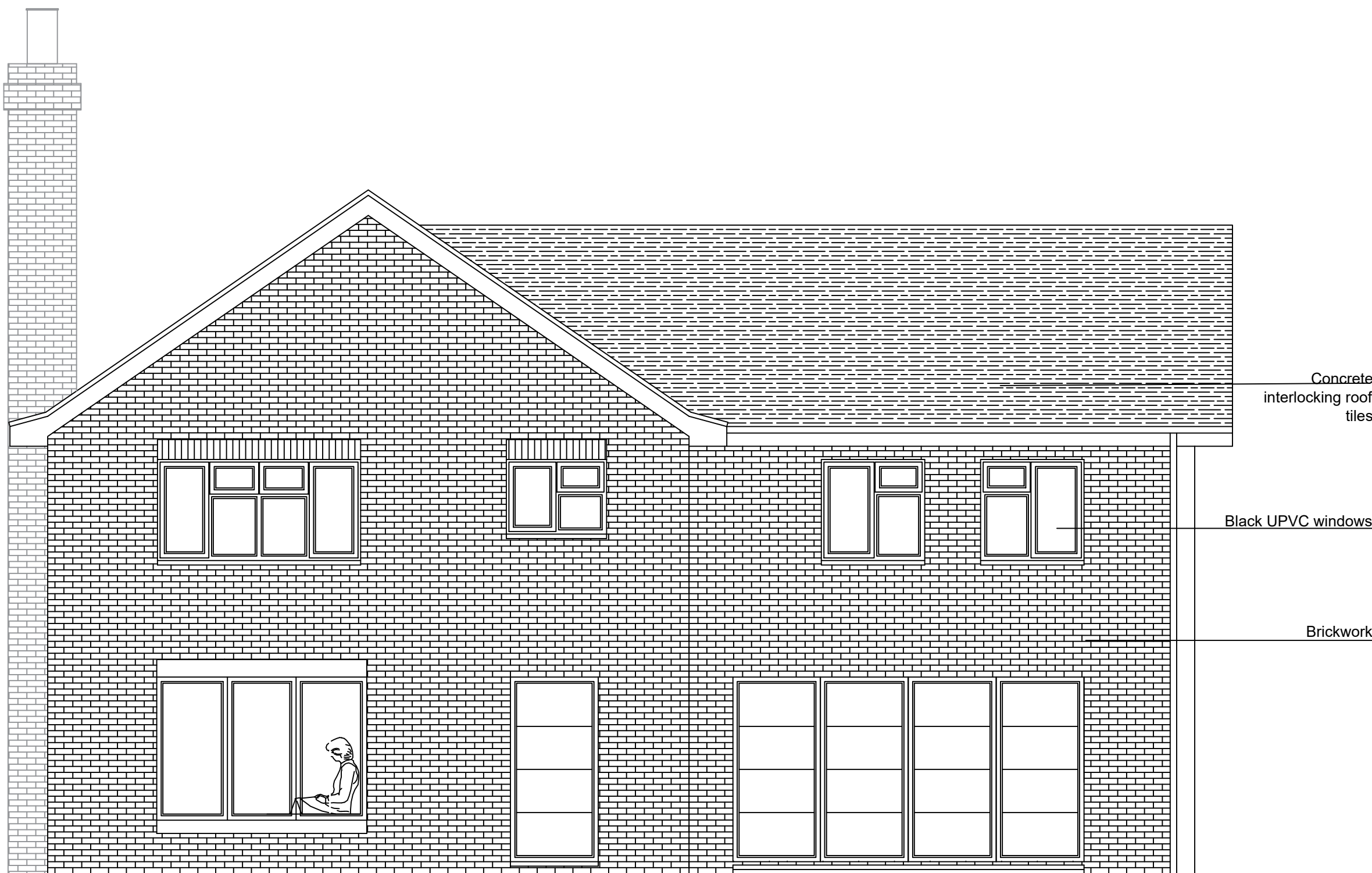
ELEVATION C PROPOSED REAR ELEVATION