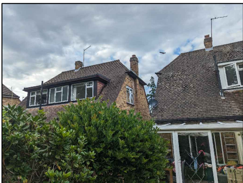
Existing Rear Photo showing No.20