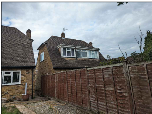
Existing Rear Photo showing No.24