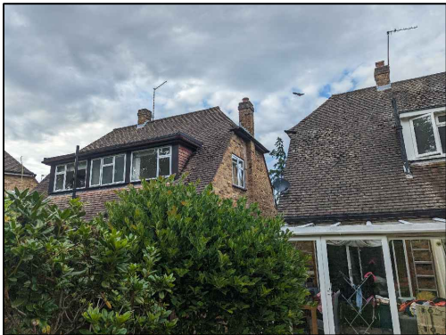
Existing Rear Photo showing No.20