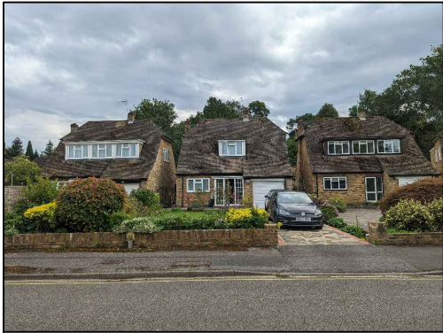
Existing Front Photo