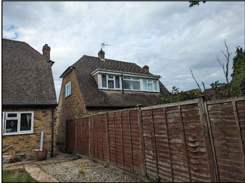
Existing Rear Photo showing No.24