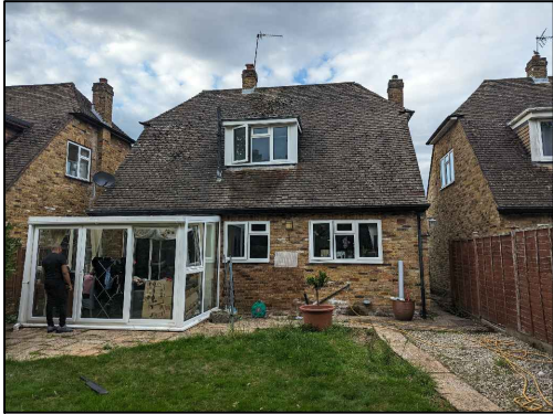
Existing Rear Photo showing No.24