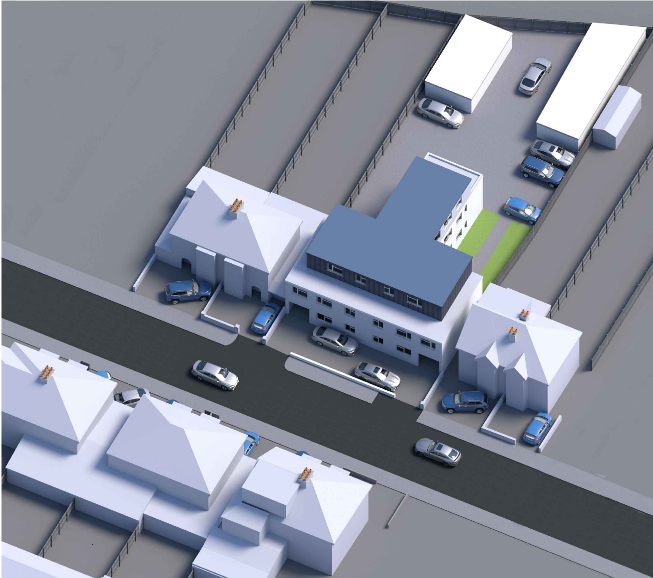
04 -PROPOSED AERIAL VIEW