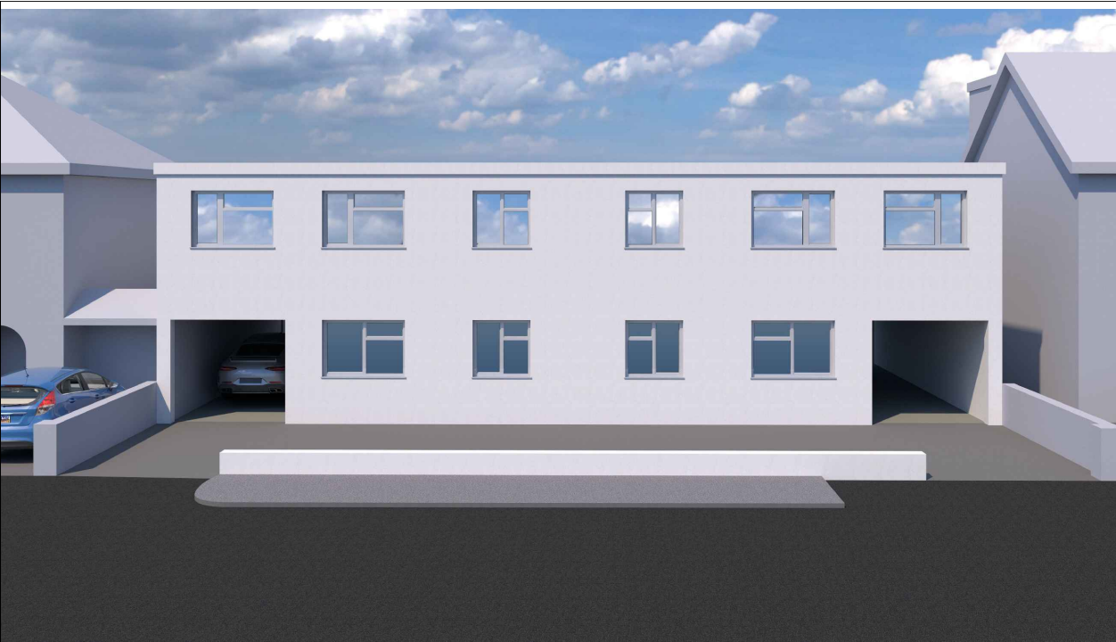
01 -EXISTING FRONT VIEW