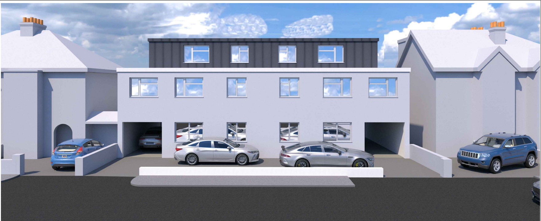
02 -PROPOSED FRONT VIEW