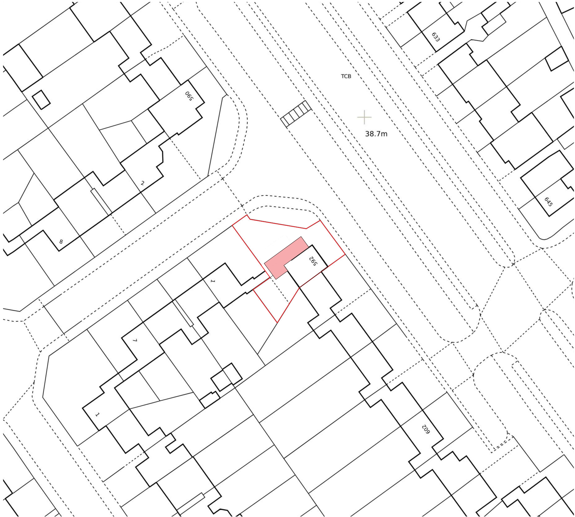
Pre-Existing Block Plan

Any dimensions shown should be checked on site and discrepancies reported to the Architect prior to construction. Designs are not coordinated with engineer projects. Do not scale for construction purposes.