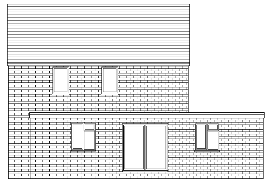
PROPOSED FRONT/SIDE ELEVATION SCALE 1:100